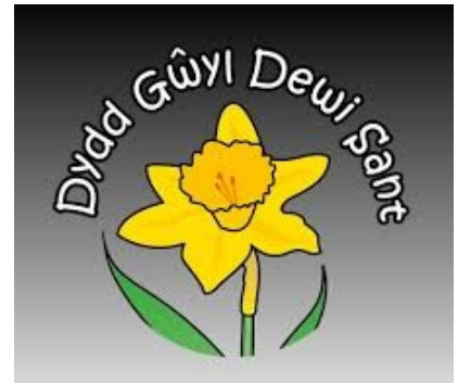
The St David's Day Lunch on 1st March was much enjoyed by those present. Many thanks to all those who helped to make it a happy time, and for the delicious food. Pictures below.