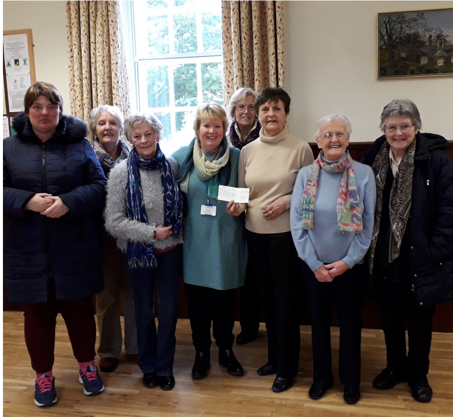
Pictured left; Some of the ladies from St Hilary's Fellowship at the presentation of the cheque to Ty Gobaith.